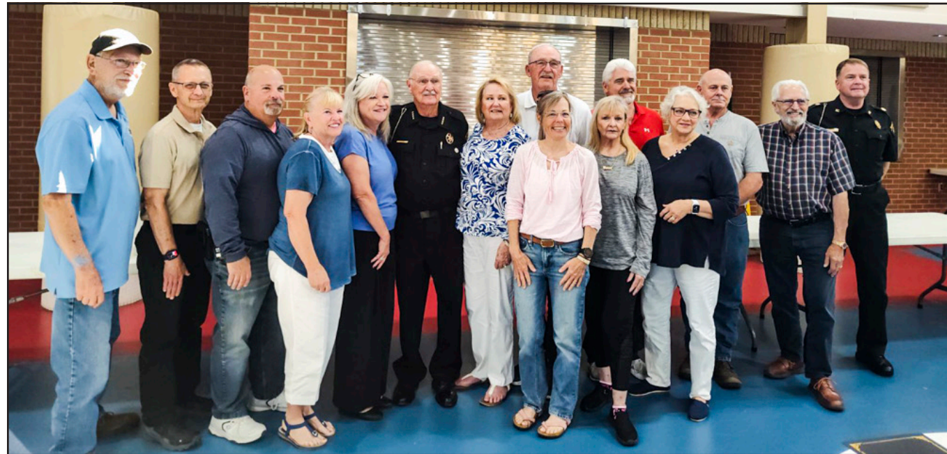
The Towns County Sheriff's Office enjoyed graduating another class from the Sheriff's Office Auxiliary Academy Program on June 11.