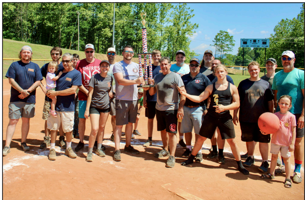
Towns County Firefighters took home the big trophy for the 2024 Family Fun Day "Guns vs Hoses" Kickball Tournament Saturday.

tation about the amazing features of drones in public safety. He is an FAA-licensed pilot who deploys the drone for search and rescue, surveillance, wildfires, fire hot spots, crime scene photography, accident reconstruction photography and all things public safety.