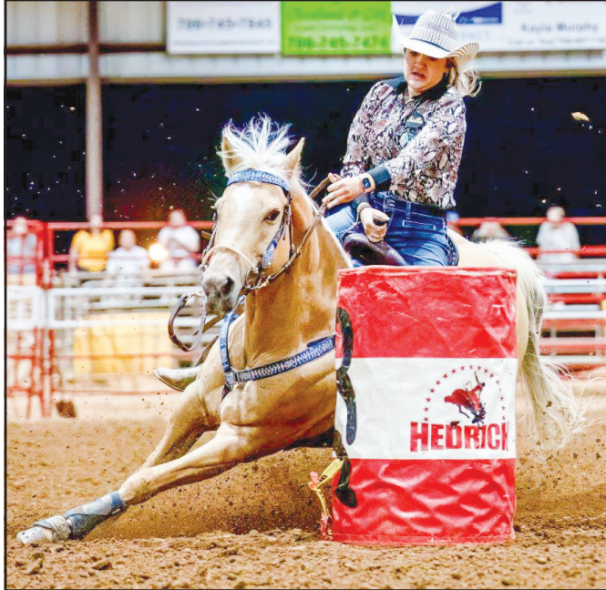
Cowgirl Barrel Racing